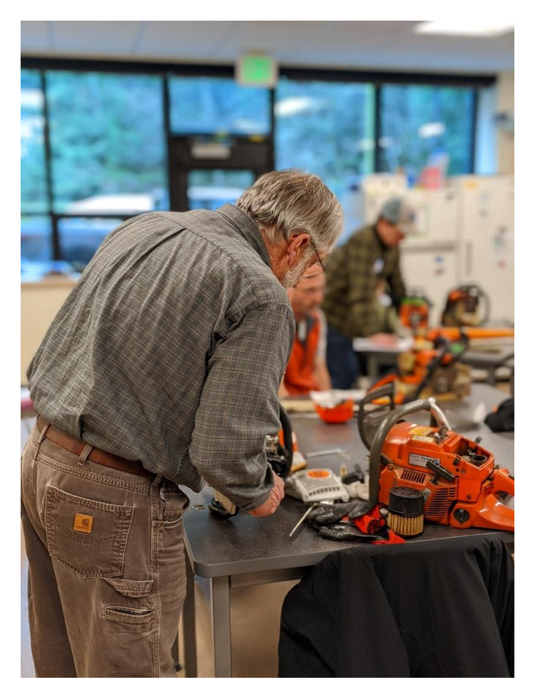
Figure 4. A participant learns about chainsaw maintenance at the Forest Owners' Winter School.

Winter School is usually offered at least twice per year between January and March, with at least one offered in western Washington and one in eastern Washington. A live webinarbased online version is sometimes offered as well. For information on upcoming Winter School programs, contact your local Extension office or visit <u>https://forestry.wsu.edu/</u>.