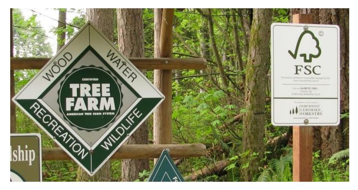
Figure 6. American Tree Farm System (ATFS) and Forest Stewardship Council (FSC) certification signs.

Certification programs are voluntary programs that provide third-party recognition of sustainable forest management. Certification programs have specific forest management standards that must be met. Wood harvested from certified properties may fetch a higher price at the mill. Eligibility requirements include a minimum number of forested acres, a written forest management plan, documentation that forest management meets the required standards, and regular on-site inspections by a representative of the certification program. Certified properties get to display certification signs (Figure 6).